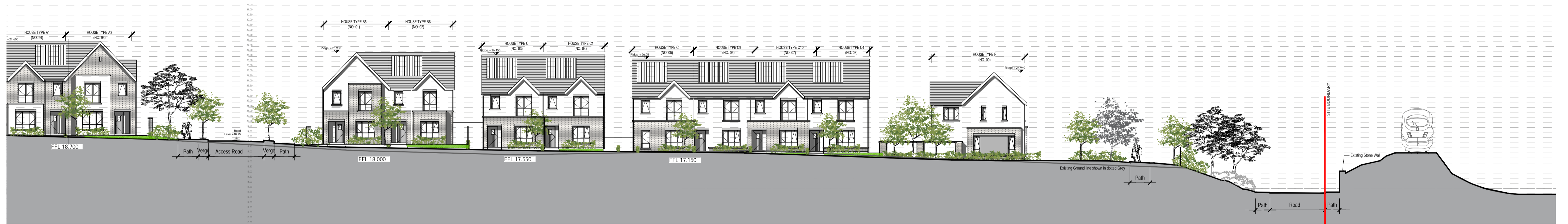
03 Site Context Elevation D-D Part 2 Scale: 1:200