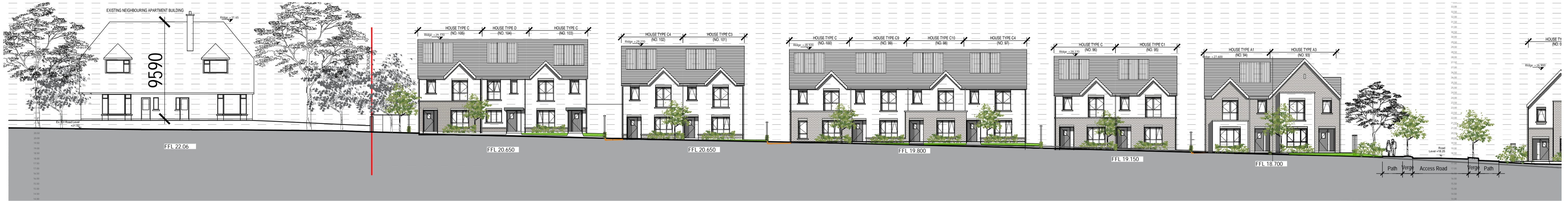
02 Site Context Elevation D-D Part 1 Scale: 1:200