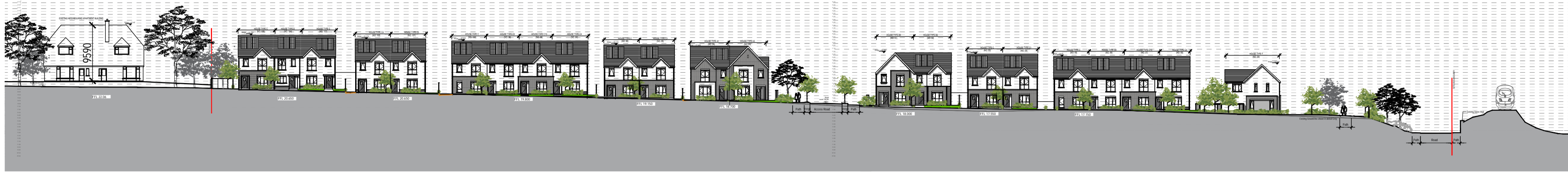
01 Site Context Elevation D-D Scale: 1:500